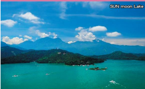
SUN moon Lake

SHOPPING STOP : Traditional Aboriginal Product, Tianlu Art Center, Pearl, Tea.